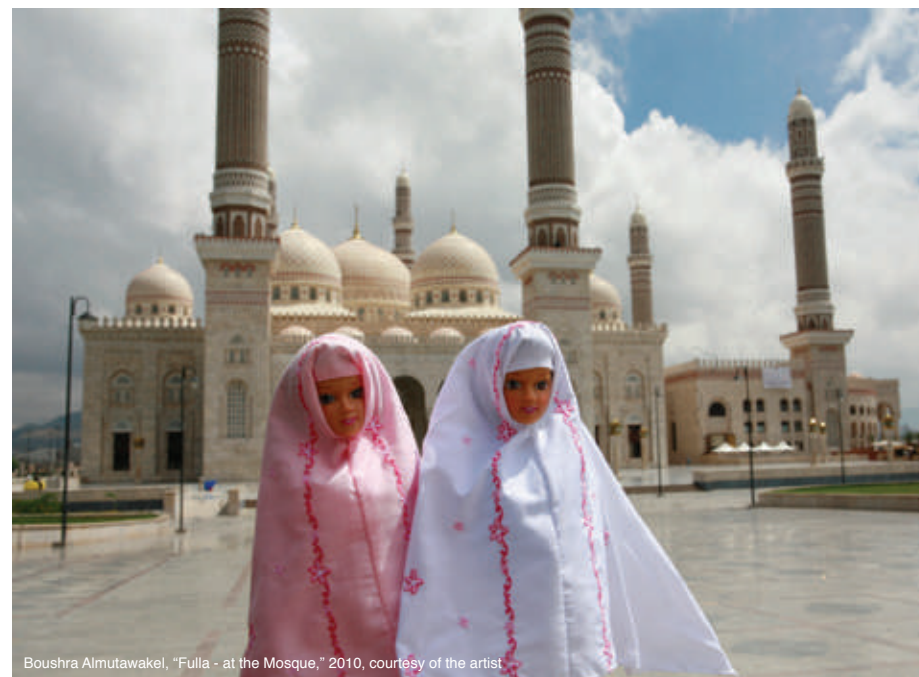
Boushra Almutawakel, "Fulla - at the Mosque," 2010, courtesy of the artist